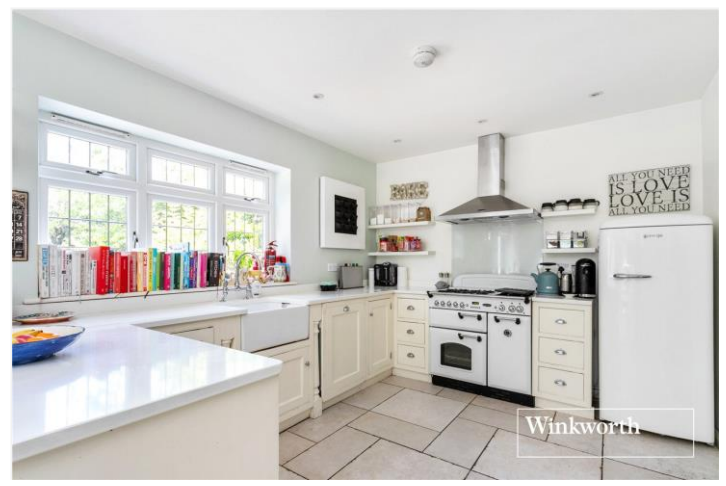
FURZEHILL ROAD, HERTFORDSHIRE, WD6 £1,075,000 FREEHOLD