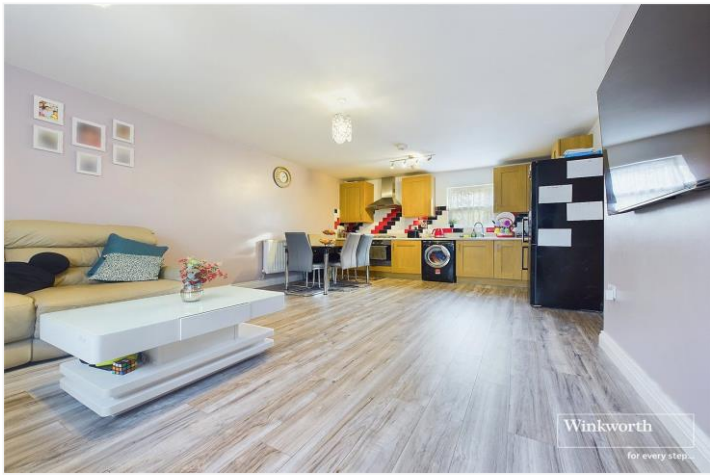
HADEN SQUARE, READING, RG1 6FE GUIDE PRICE £300,000 LEASEHOLD