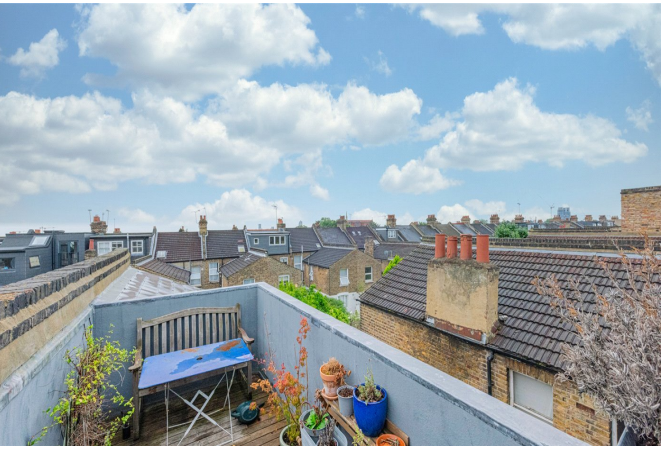
PURVES ROAD, LONDON, NW10 £725,000 LEASEHOLD

DESIGNED AND FINISHED TO A HIGH STANDARD THIS 1,048 SQFT SPLIT LEVEL FLAT WITH SOUTH-FACING ROOF TERRACE AND EXCEPTIONAL VIEWS OVER THE CITY OF LONDON.