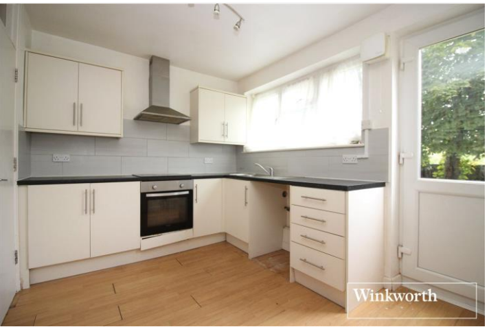
VALENTINE COURT, ELSTREE, BOREHAMWOOD, WD6 £299,950 LEASEHOLD