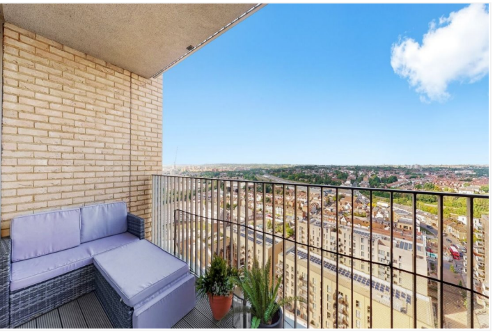
HAWFINCH HOUSE, WEST HENDON, LONDON, NW9 £450,000 LEASEHOLD