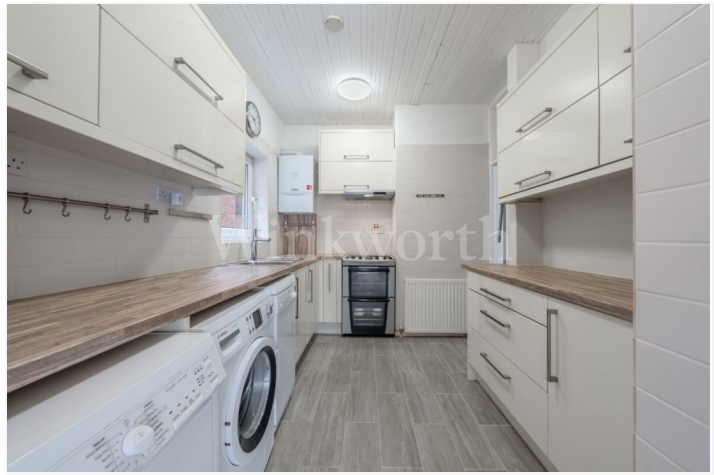
PATTISON ROAD, CHILDS HILL, LONDON, NW2 £725,000 SHARE OF FREEHOLD