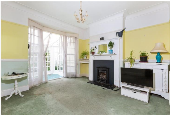
THIRSK ROAD, CR4 OIEO £550,000 FREEHOLD