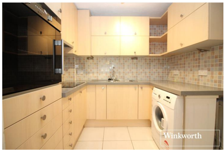
FURZEHILL ROAD, HERTFORDSHIRE, WD6 £175,000 LEASEHOLD