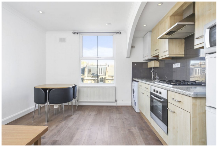
LOFTUS ROAD, LONDON, W12