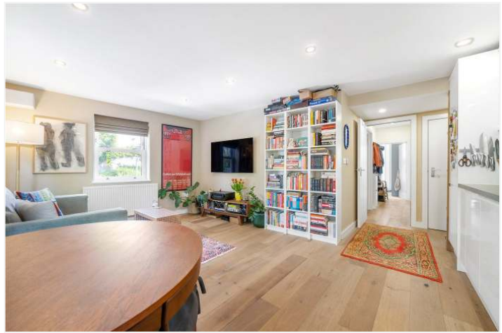
LYNDHURST WAY, PECKHAM RYE, LONDON, SE15 £525,000 SHARE OF FREEHOLD