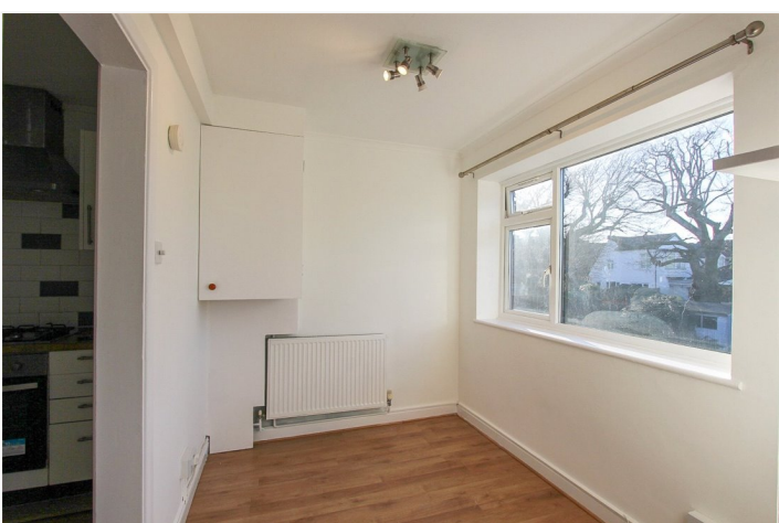
CHALKWELL PARK DRIVE, LEIGH ON SEA £300,000 LEASEHOLD