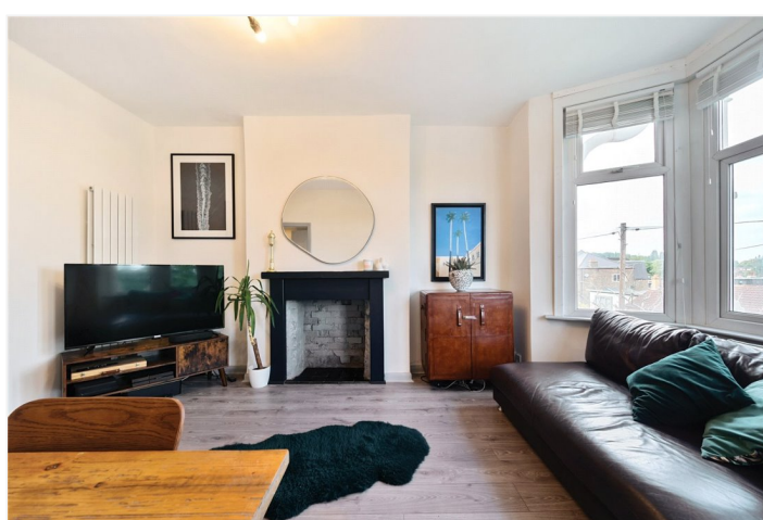
CODRINGTON HILL, LONDON, SE23 £425,000 LEASEHOLD

Forest Hill | | foresthill@winkworth.co.uk