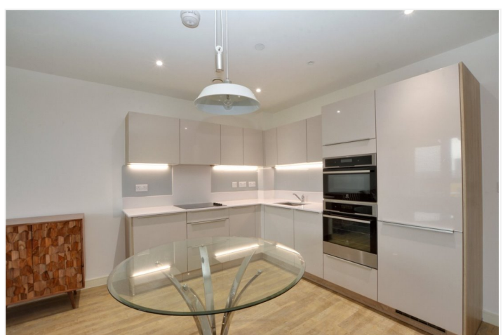
OSSEL COURT, GREENWICH, LONDON, SE10 £600,000 LEASEHOLD

AN ABSOLUTELY STUNNING TWO BEDROOM 10TH FLOOR APARTMENT, THAT MEASURES AN IMPRESSIVE 855 SQUARE FOOT, FEATURING TWO LARGE COVERED BALCONIES, WITH SUPERB RIVER VIEWS! THE PROPERTY ALSO FEATURES OFF STREET PARKING. EWS1 COMPLIANT!