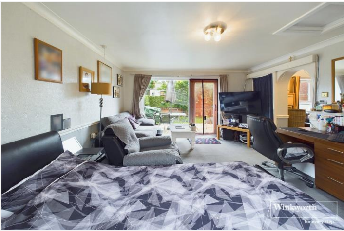
ORTS ROAD, BERKSHIRE, RG1 3JS OFFERS IN EXCESS OF £375,000 FREEHOLD