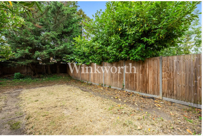
KELVIN AVENUE, N13 OFFERS OVER £400,000 LEASEHOLD

A TWO-BEDROOM GARDEN FLAT IN A CONVENIENT LOCATION REQUIRING SOME MODERNISATION AND POTENTIAL TO EXTEND (SUBJECT TO PLANNING AND LANDLORD CONSENT). OFFERED CHAINFREE AND A NEW 999 YEAR LEASE ON COMPLETION.