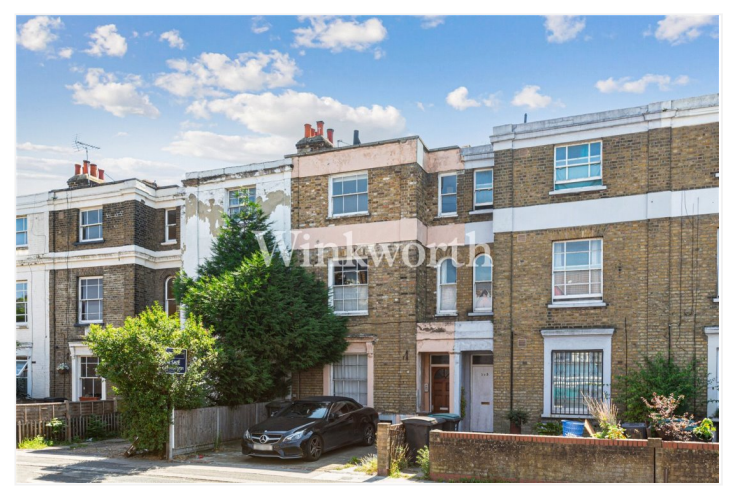
PHILIP LANE, N15 £400,000 LEASEHOLD