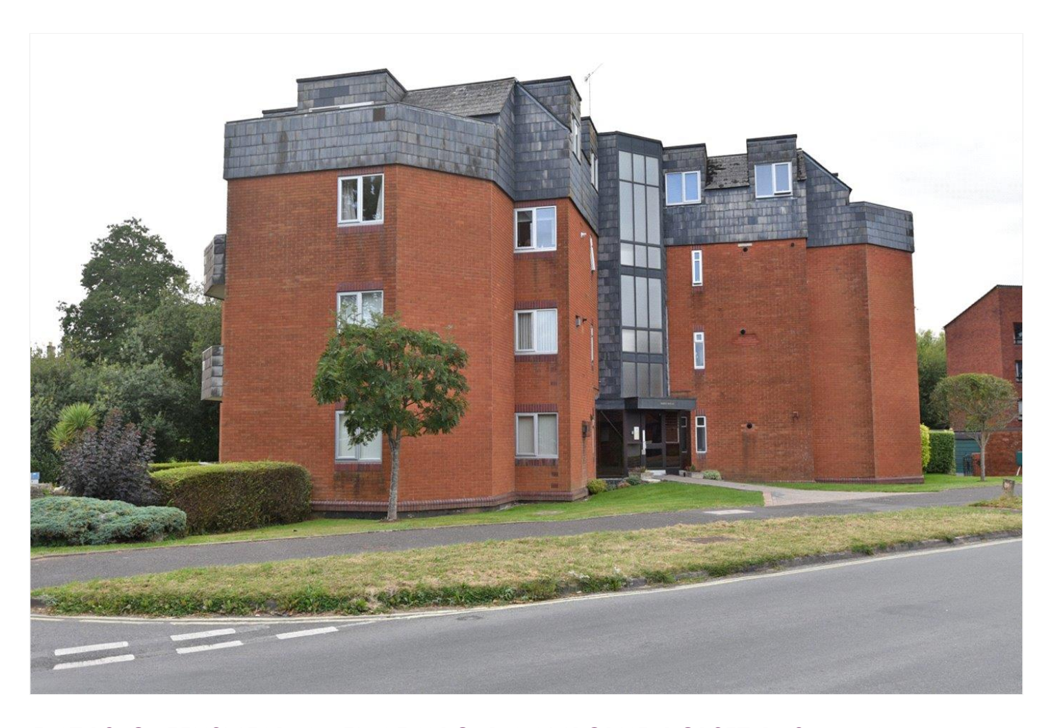
FLAT P2, QUEENSMEAD, ALLENVIEW ROAD, WIMBORNE, DORSET, BH21 1UW £237,500 SHARE OF FREEHOLD

CENTRALLY LOCATED, 1 BEDROOM THIRD FLOOR PENTHOUSE APARTMENT WITHIN A DESIRABLE 1980S BUILT APARTMENT BLOCK ACCESSED VIA A LIFT OR INTERIOR STAIRWAY, WITHIN LEVEL WALKING DISTANCE OF WIMBORNE TOWN CENTRE AND ITS WIDE RANGE OF AMENITIES. NO FORWARD CHAIN. AT A GLANCE