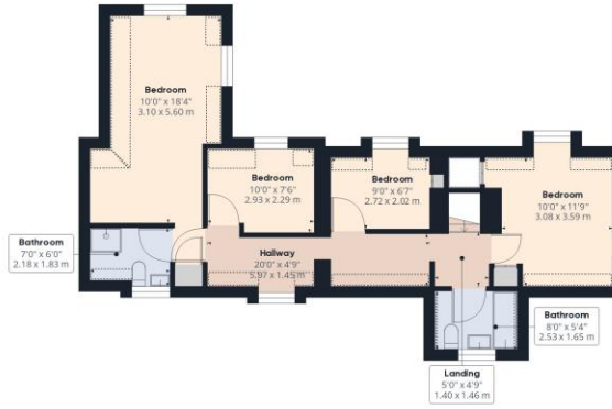
Floor 1 Building 1