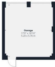
Ground Floor Building 2