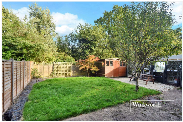
STONELEIGH PARK ROAD, EPSOM, SURREY, KT19 £390,000 LEASEHOLD

A BEAUTIFULLY PRESENTED TWO DOUBLE BEDROOM GROUND FLOOR MAISONETTE FEATURING A PRIVATE REAR GARDEN SET CLOSE TO STONELEIGH STATION