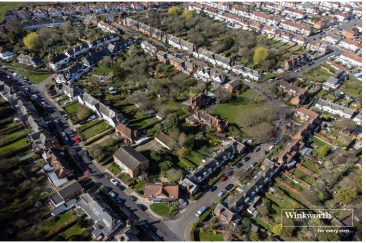
GOLDSMITH LANE, ROE GREEN VILLAGE, KINGBSURY, NW9 £745,000 FREEHOLD