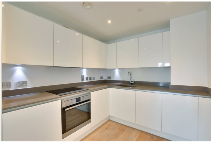
LOVE LANE, SE18 £370,000 LEASEHOLD