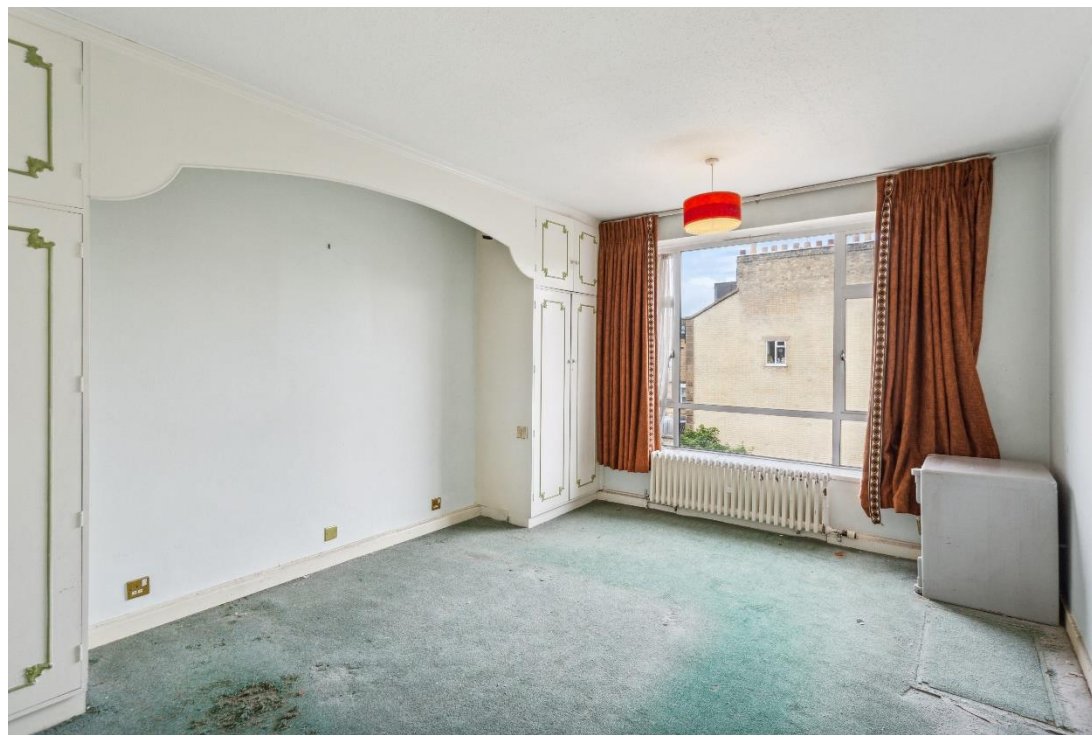
Unmodernised | Private Roof Terrace | Fourth Floor (with lift)