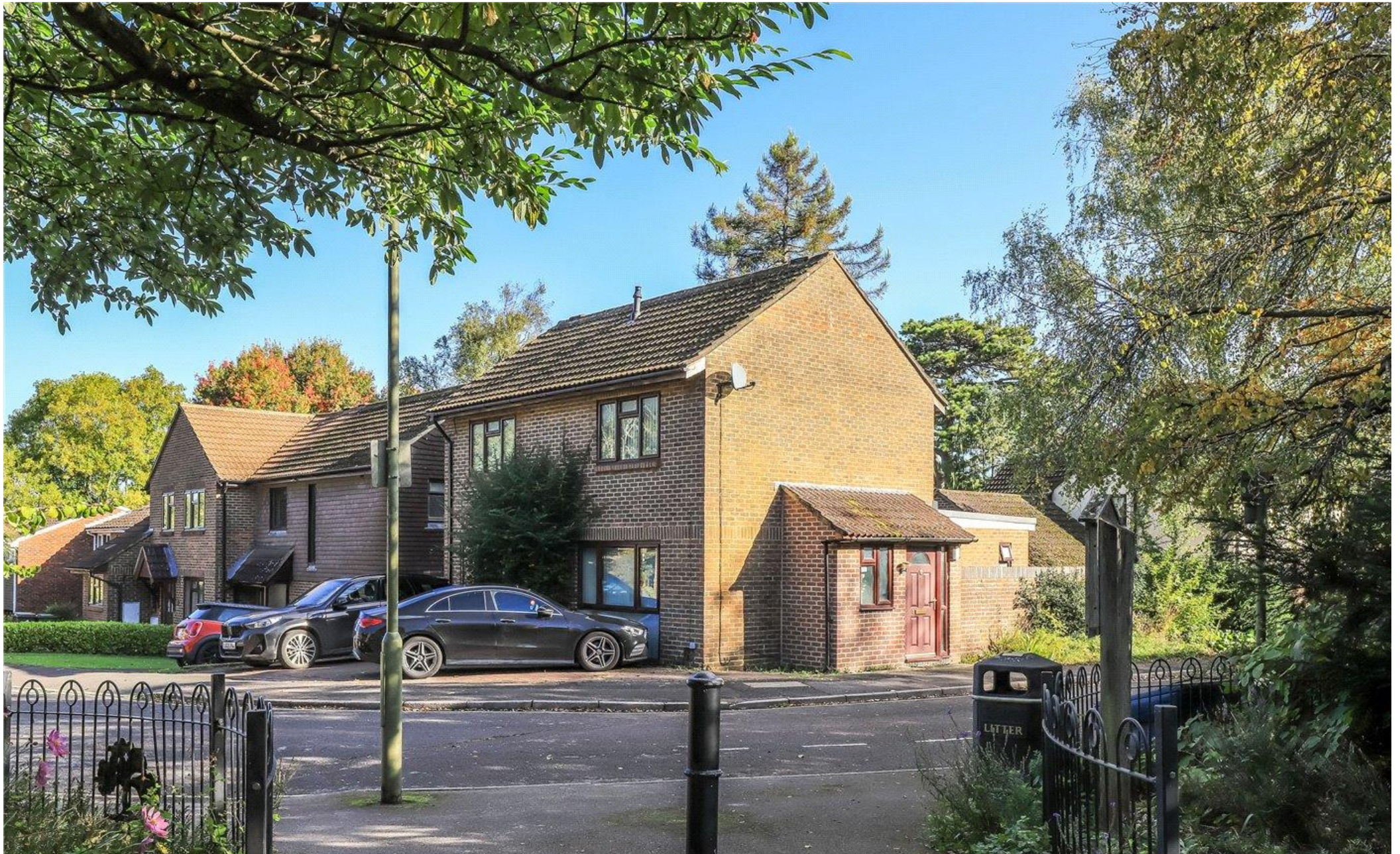
Nursery Gardens, Winchester, Hampshire, SO22 5DT