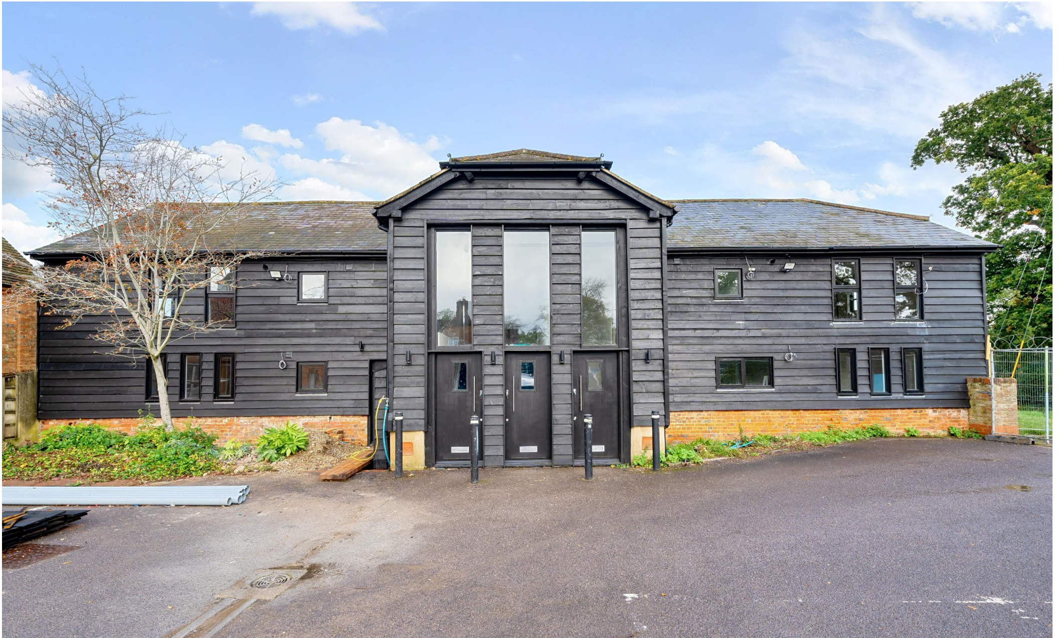
One Kestrel Court Vyne Road Sherborne St John Basingstoke RG24 9HJ