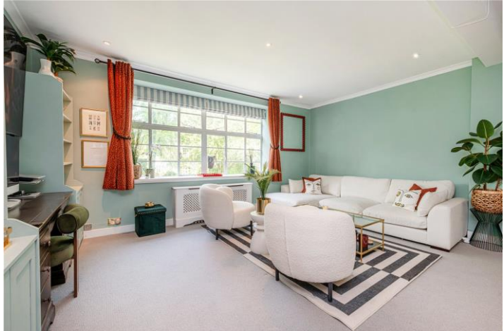
FLAT 4, LADBROKE GROVE HOUSE, 77 LADBROKE GROVE, LONDON, W11 £925,000 SHARE OF FREEHOLD

AN WONDERFULLY PRESENTED, EXTREMELY WELL PORTIONED ONE BEDROOM RAISED GROUND FLOOR APARTMENT, OVERLOOKING LANSDOWNE CRESCENT COMMUNAL GARDENS.