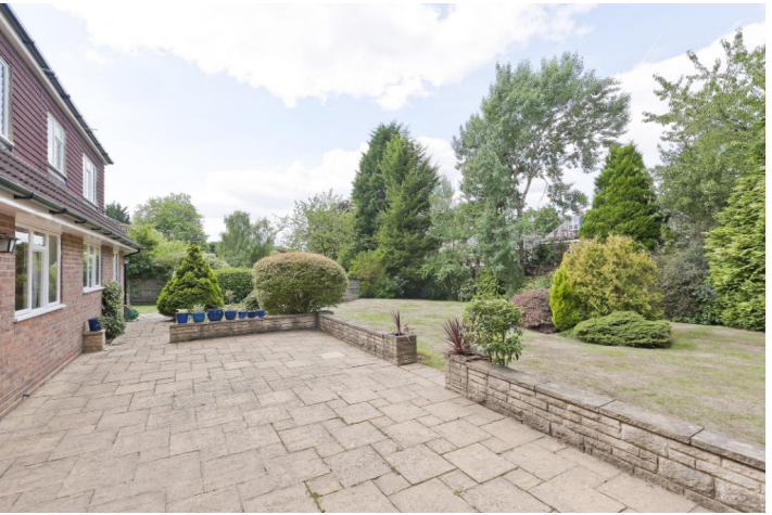
ASHCROFT PARK, COBHAM, SURREY, KT11 £3,600 PER MONTH UNFURNISHED