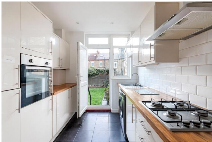
TOPSHAM ROAD, SW17 £775,000 TO FREEHOLD