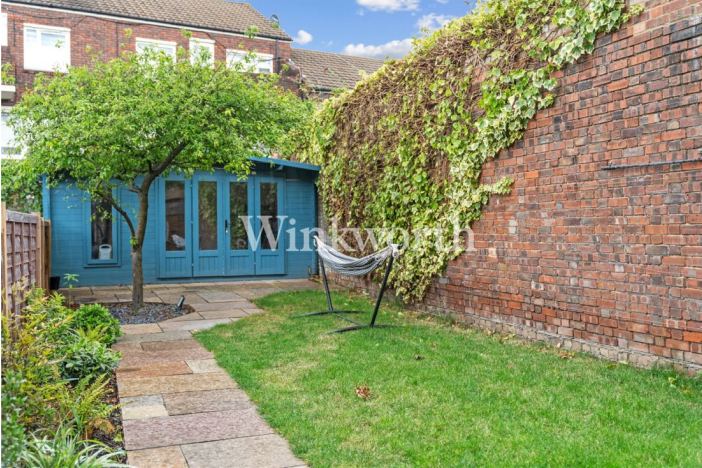
CLARENDON ROAD, N15 £850,000 FREEHOLD