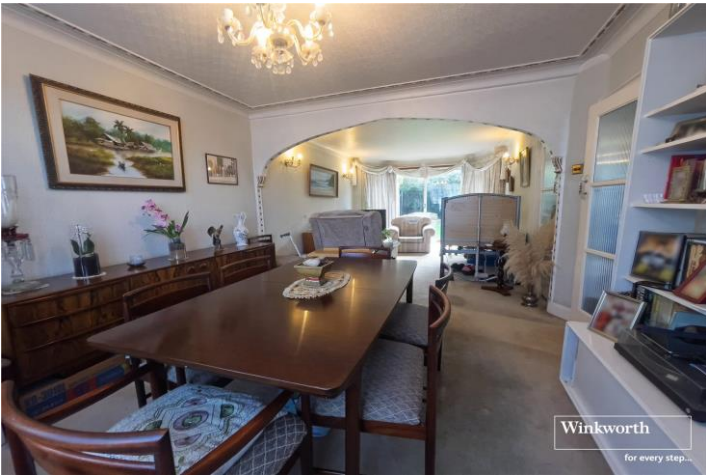
BEVERLEY DRIVE, EDGWARE, MIDDLESEX, HA8 £700,000 FREEHOLD