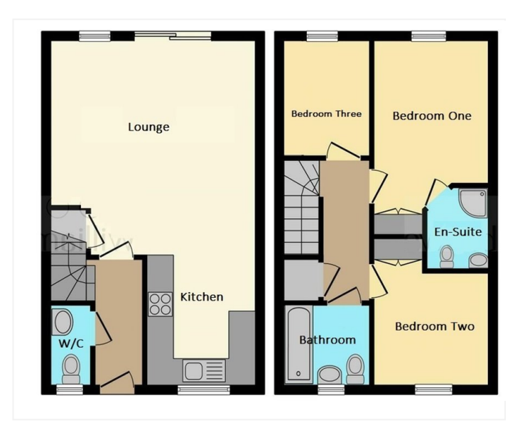
This floorplan is for illustration purposes only and is not to scale. The position and size of doors, windows, appliances and other features are approximate.