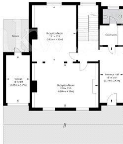
Ground Floor GROSS INTERNAL FLOOR AREA APPROX. 110.91 SQ M / 1194 SQ FT