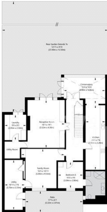
Lower Ground Floor GROSS INTERNAL FLOOR AREA APPROX. 135.17 SQ M / 1455 SQ FT