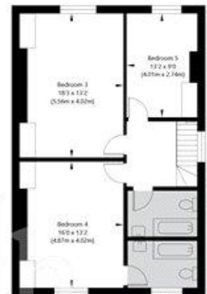
Second Floor GROSS INTERNAL FLOOR AREA APPROX. 72.68 SQ M / 782 SQ FT

APPROXIMATE GROSS INTERNAL FLOOR AREA 402.5 SQ M / 4332 SQ FT