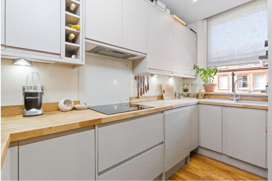
Prime Location | new 250yr Lease | Excellent Condition | Two Double Bedrooms