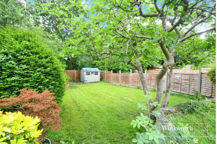
DONNINGTON ROAD, WORCESTER PARK, KT4 £550,000 FREEHOLD

A TWO BEDROOM DETACHED BUNGALOW FEATURING A SOUTHERLY ASPECT 120FT APPROX. REAR GARDEN LOCATED WITHIN EASY REACH OF WORCESTER PARK HIGH STREET