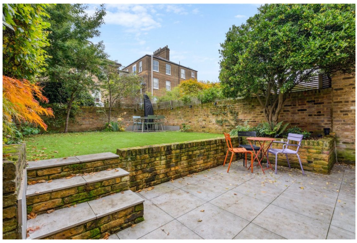
SPENCER WALK, LONDON, SW15 £6,500 PER MONTH UNFURNISHED