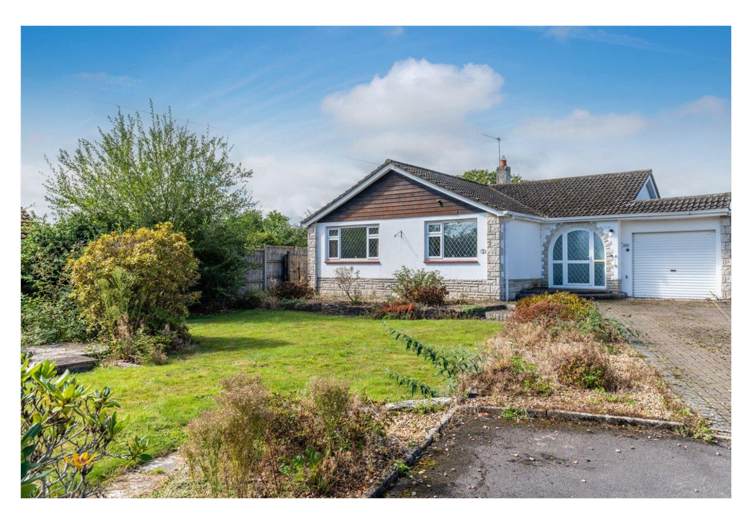
150 FOXCROFT DRIVE, WIMBORNE, DORSET, BH21 2LA £425,000 FREEHOLD

A LINK DETACHED 2 DOUBLE BEDROOM BUNGALOW SITUATED IN A QUIET RESIDENTIAL CUL-DE-SAC, WITH A LARGE FRONT GARDEN, GARAGE/WORKSHOP, AMPLE OFF ROAD PARKING, AND POTENTIAL FOR BOTH RENOVATION AND EXTENSION, SUBJECT TO THE NECESSARY PLANNING CONSENTS.