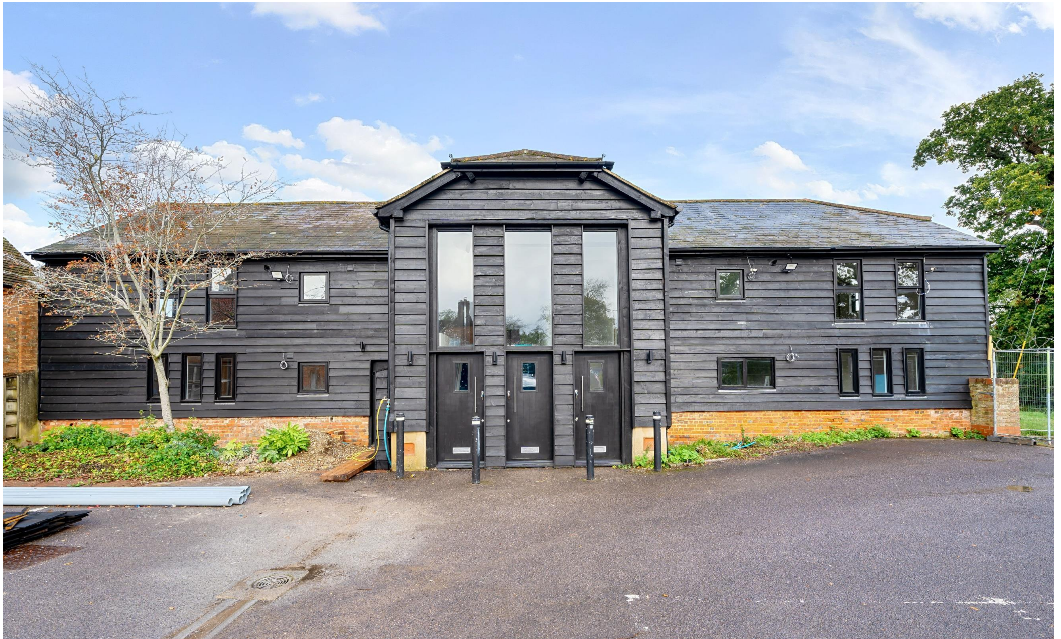
Two Kestrel Court Vyne Road Sherborne St John Basingstoke RG24 9HJ