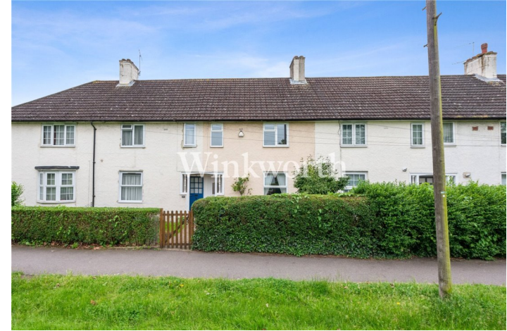
THE ROUNDWAY, N17 £480,000 FREEHOLD