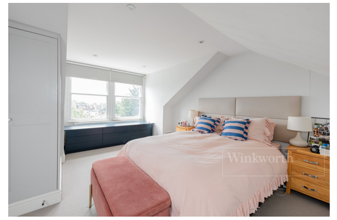
BATHURST GARDENS, LONDON, NW10 £849,950 SHARE OF FREEHOLD

AN INCREDIBLE THREE BEDROOM, TWO BATHROOM, SPLIT LEVEL FLAT WITH PRIVATE ENTRANCE IN A DOUBLE FRONTED PERIOD CONVERSION.