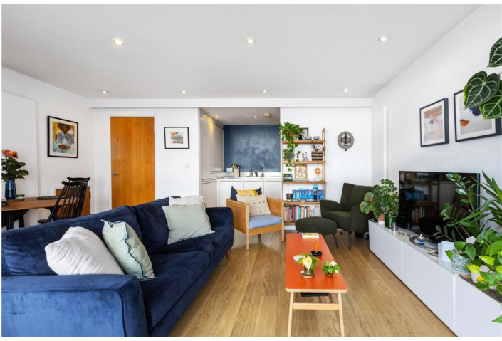
BACON STREET, LONDON, E2 £585,000 LEASEHOLD