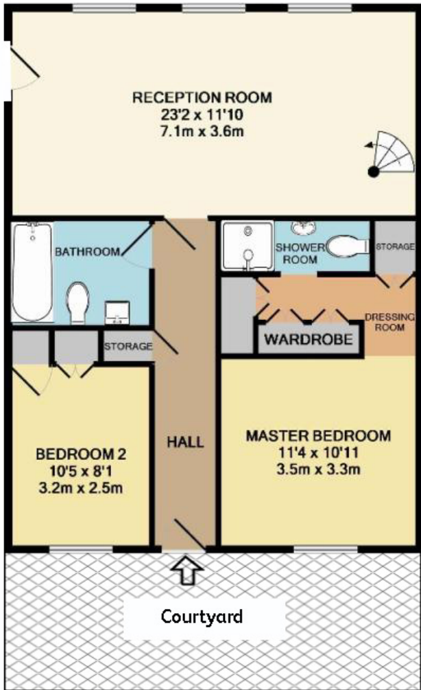
Ground Floor 707 sq.ft ( 65.7 sq.m)