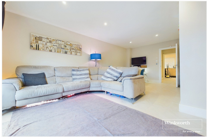
THE GABLES, PADWORTH, BERKSHIRE, RG7 5HR OFFERS IN EXCESS OF £350,000 FREEHOLD

A CONTEMPORARY THREE BEDROOM TOWN HOUSE IN A CONVENIENT LOCATION BETWEEN READING AND NEWBURY AND JUST A MILE FROM ALDERMASTON TRAIN STATION