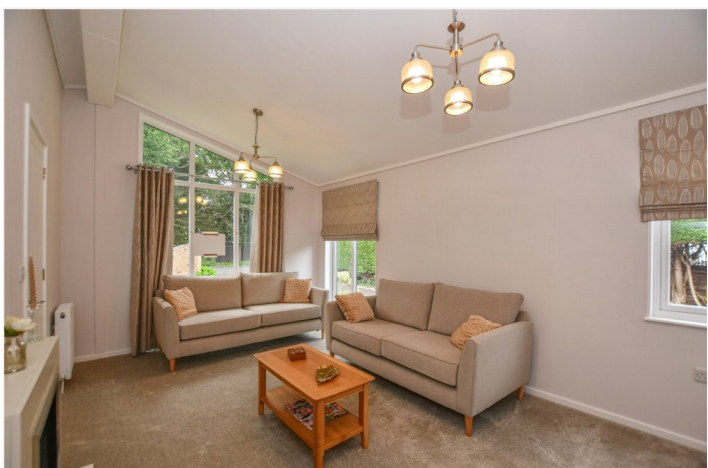
1 PINEWOOD CARAVAN PARK, WOKINGHAM, BERKSHIRE, RG40 3EF £220,000 VIRTUAL FREEHOLD

SITUATED ON A SITE OF 20 SIMILAR PARK HOMES THIS BRAND NEW LODGE, KNOWN AS THE PRESTIGE MAJESTIC, IS 40FT X 20FT AND IS EXCLUSIVELY FOR THE OVER 55'S.