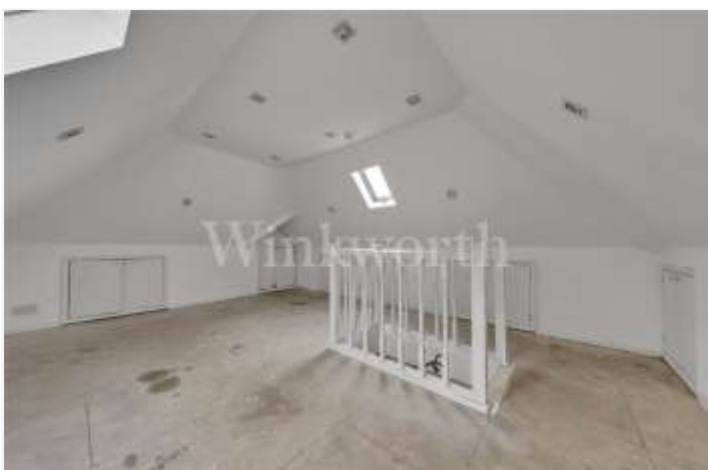
ST. JOHNS ROAD, NW11 £1,000,000 FREEHOLD

A detached corner property, currently as 2 flats