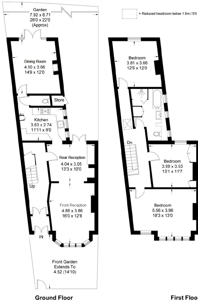
Illustration for identification purposes only, measurements are approximate, not to scale. (ID257293)

This floorplan is for illustration purposes only and is not to scale. The position and size of doors, windows, appliances and other features are approximate.