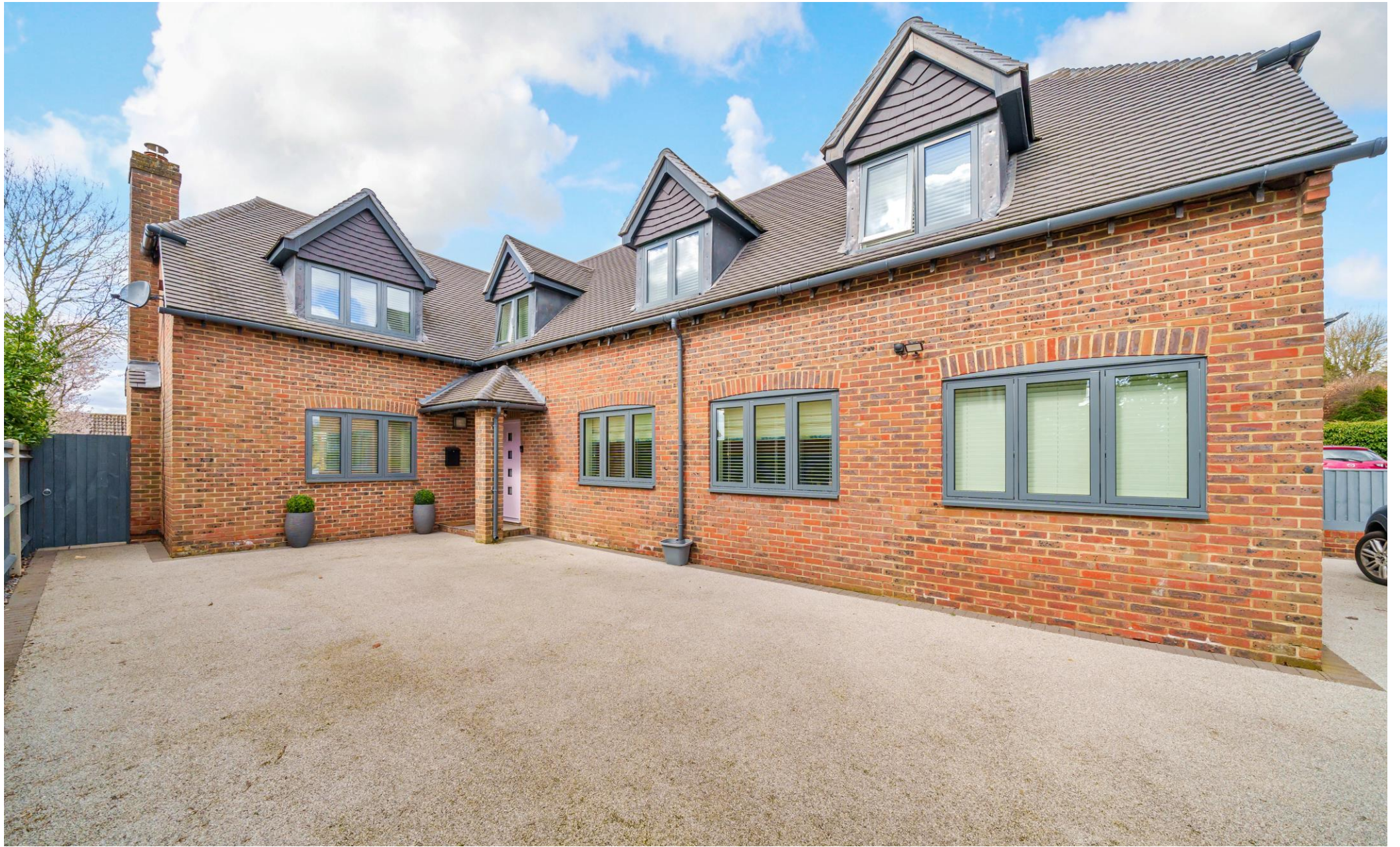
ROWBURY HOUSE COLD ASH HILL, COLD ASH, THATCHAM, RG18 9PJ