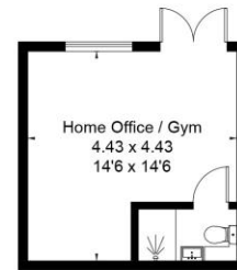
(Not Shown In Actual Location / Orientation)