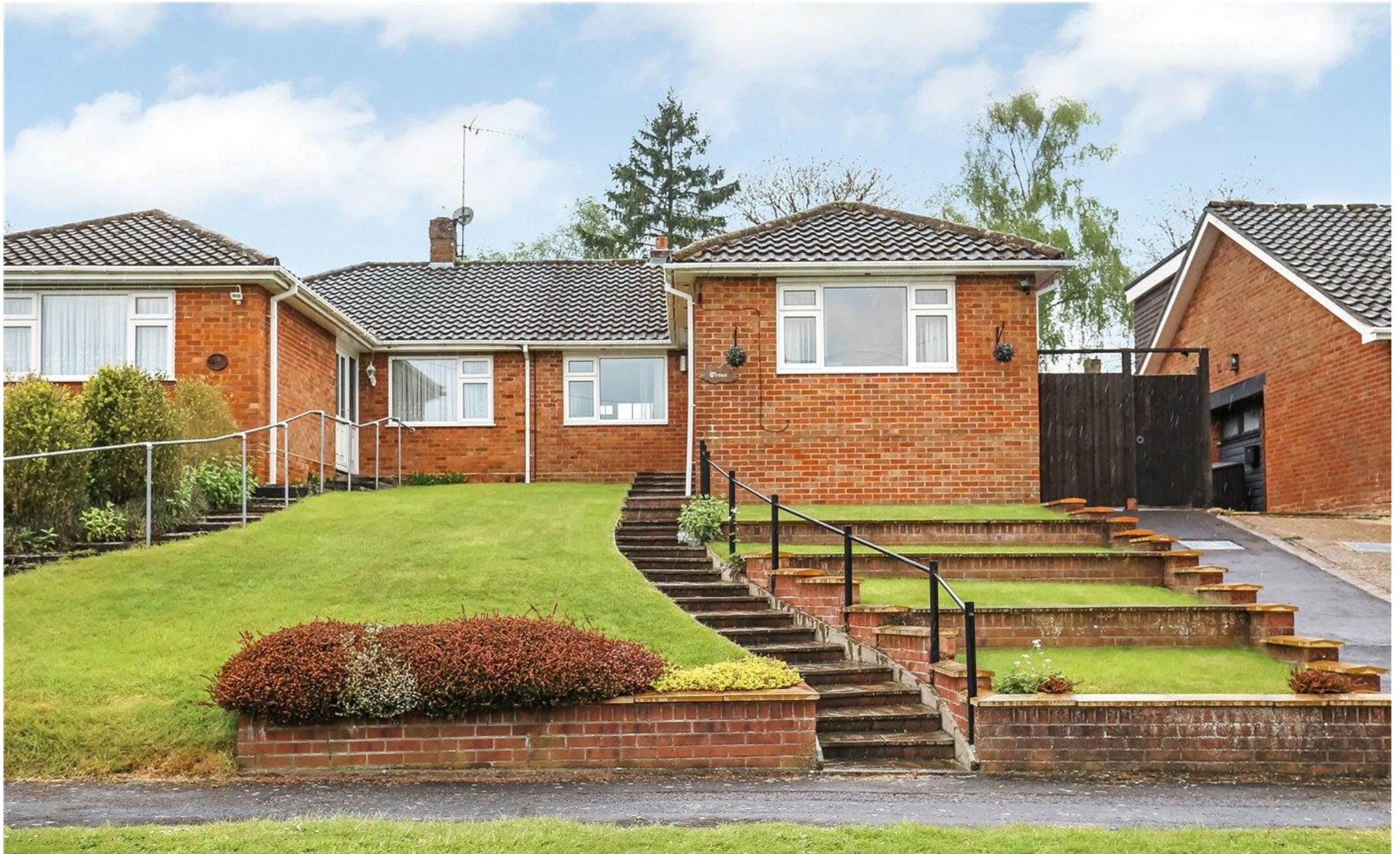
Goring Field, Winchester, Hampshire, SO22 5NH