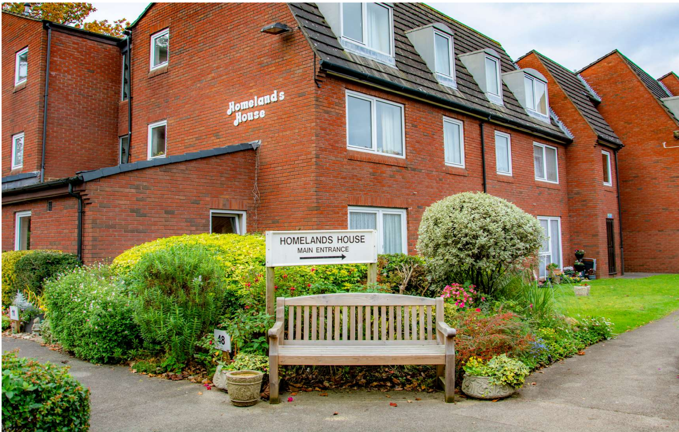
9 Homelands House, 535 Ringwood Road Ferndown, BH22 9DA Guide Price £75,000