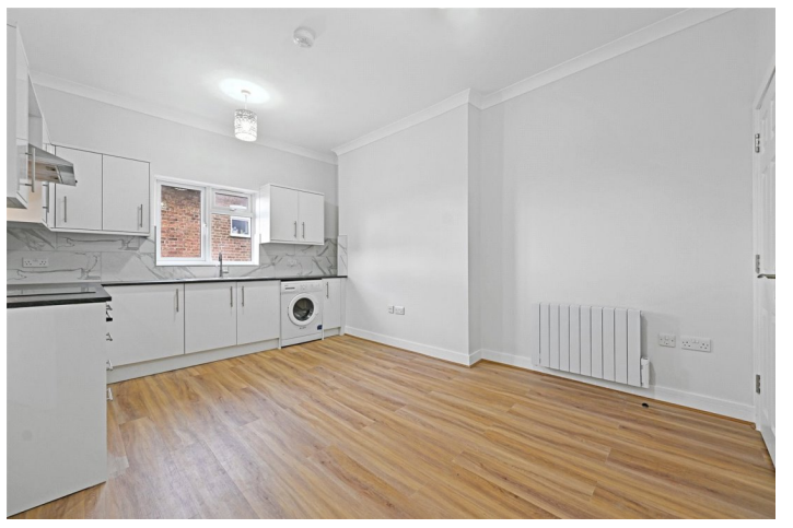
UXBRIDGE ROAD, SHEPHERDS BUSH, LONDON, W12 £2,200 PER MONTH FURNISHED, PART FURNISHED, UNFURNISHED £2,200 PER CALENDAR

A newly refurbished two bedroom flat located close to all local amenities, Furnished/Unfurnished, Available immediately