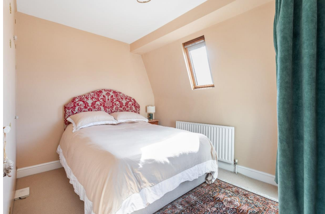
Two double bedrooms | Leasehold | split – level | balcony