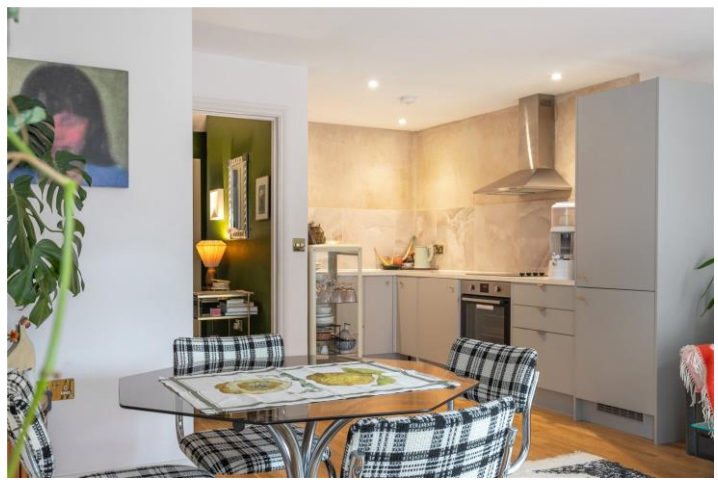
BEATTY ROAD, LONDON, N16 OIEO £460,000 LEASEHOLD